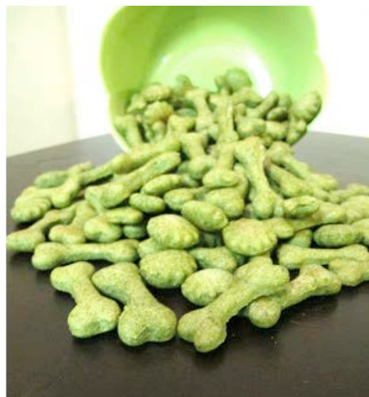
They're magically delicious!

Tip: Write date on plastic bag to keep track of expiration date.