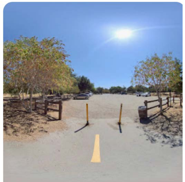
Silver Creek Staging Area / Coyote Creek Parkway · 6039-6049 Silver Creek Valley Rd, San Jose, CA 95138